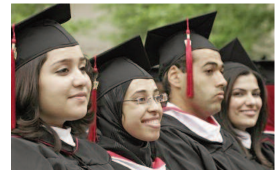
Rutgers-Newark graduating seniors, Commencement 2007

Cover painting by Bou Meng, survivor of the Cambodian genocide, reprinted by permission of the Documentation Center of Cambodia